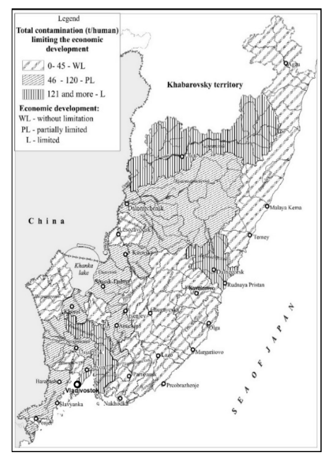
Figure 1. Pollution of Primorsky Krai

Given the low environmental friendliness of industrial and natural relations in Primorsky Krai at the present time, it can be assumed that with the im-